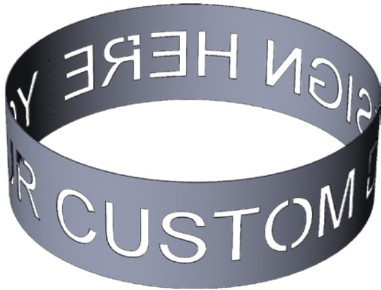
Circular Fire Ring Design